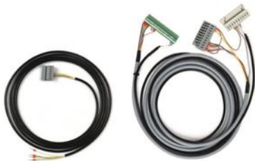
Otis Wiring Kit