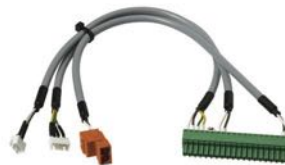
Schindler Wiring Kit