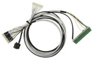
Kone Wiring Kit